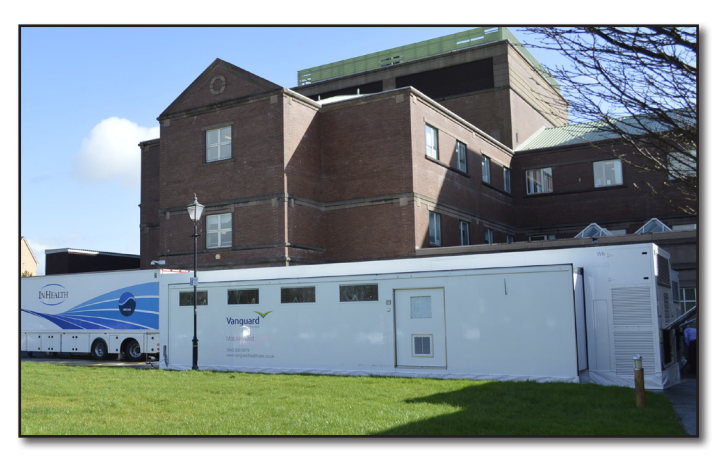
Our temporary Mobile Eye Unit is now operational

Phase two of our expansion will involve orthopaedic and other surgical elective care capacity. Work to model the requirements is at a very early stage, and is being planned and developed in partnership with colleagues across Scotland.