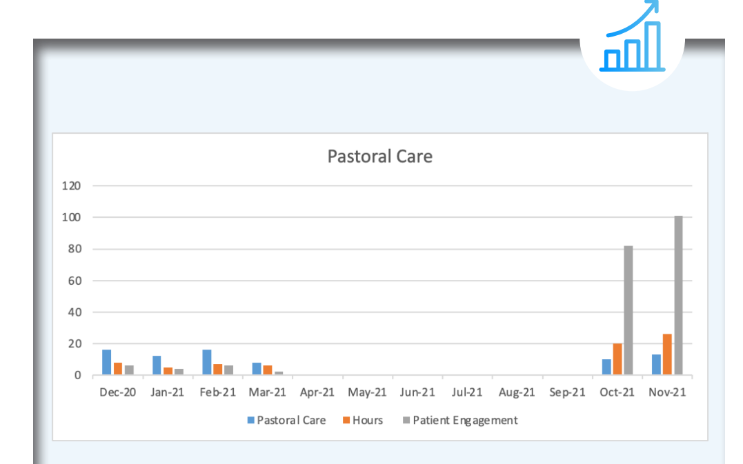
Table 2. During the recovery phase, pastoral care volunteers where the first to come back following a gap.