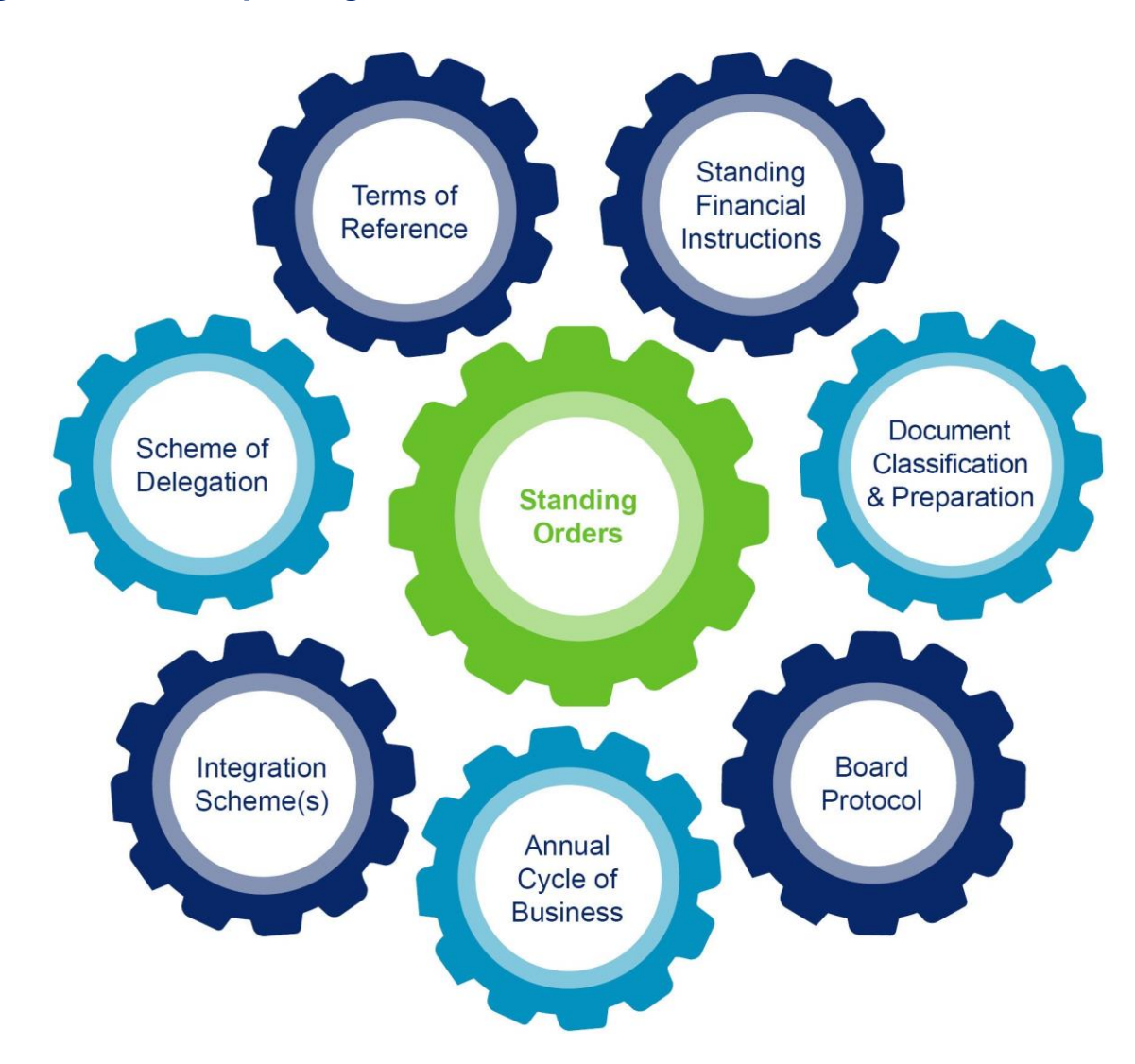
Figure Four – The Operating Guidance

4.175 The detailed description of the NHS Board's governance arrangements and the guidance on implementing these arrangements are contained in a portfolio of documents that is developed, maintained and communicated by the Board Secretary. It includes Standing Orders, Standing Financial Instructions and the Schemes of Delegation that provide the senior leadership and management of the NHS with their principal operating guidance.