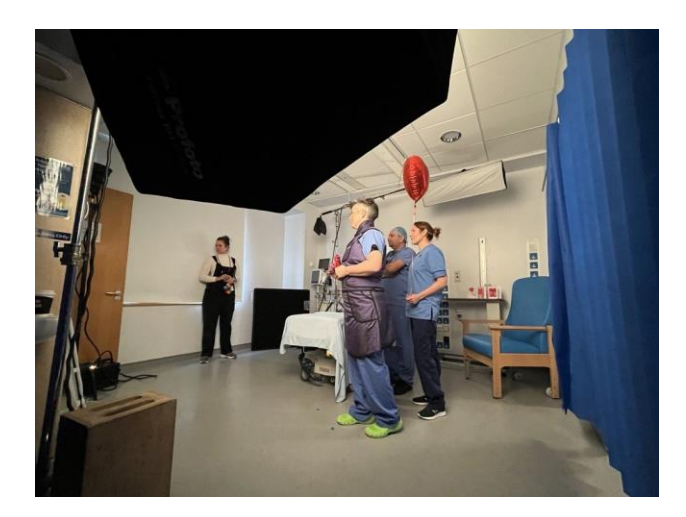
1 - Lights, camera, action!