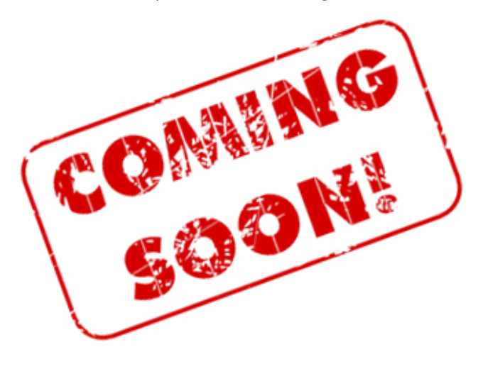
Please email your thoughts to <u>Comms</u> by close of play on Friday 8 March.